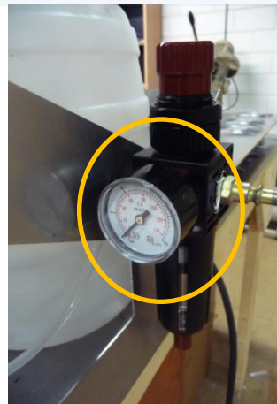
Hotfog RLVM 5 bar

Bring the pressure up or down by pulling up slightly on the knob from the reducer En turn it right to have more pressure en left to have lower pressing. first before pulling up slightly on the knob.