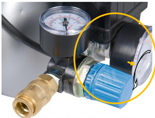
Compressor 7-8 bar

Bring the pressure up or down by pulling up slightly on the knob from the reducer En turn it right to have more pressure en left to have lower pressing.